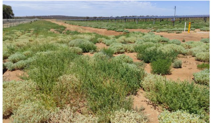
Source: SA Water Zero Cost Energy Future seeding trial at Sedan 2020