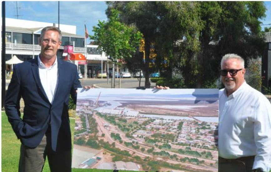
PLANTING PROJECT: Deputy Premier Dan van Holst Pellekaan and Port Pirie Mayor Leon Stephens with a rendering of how a greener Pirie might look.

The $6.1 million has been allocated to the following projects: